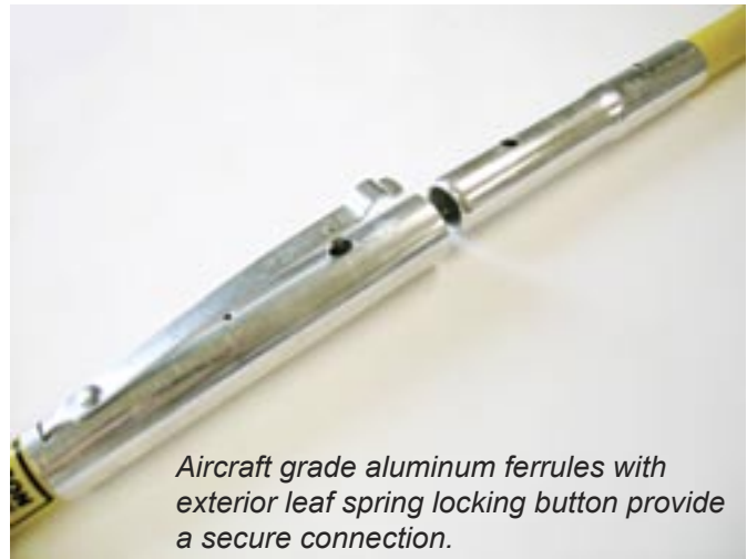
Aircraft grade aluminum ferrules with exterior leaf spring locking button provide a secure connection.

All poles are 1.25" diameter so they can be used together in any combination you need. For added versatility, Jameson's unique adapter system allows the use of different tools with the same pole.